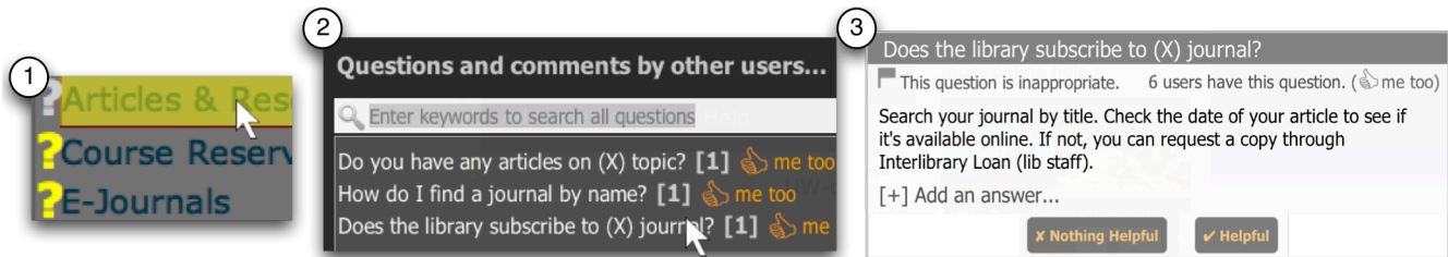
Figure 1. Main components of the LemonAid interface in the help mode: (1) a user selects an on-screen label or image highlighted in yellow; (2) the user's selection triggers the retrieval of relevant questions; (3) the user can click on a question to see the answer(s) for that question and indicate whether the answer was helpful or not helpful.

questions marks are dynamically generated as soon as a user enters the help mode based on the selections of previously asked questions. To help users remember which UI elements they have already viewed, the system modifies the color of the visited question marks.