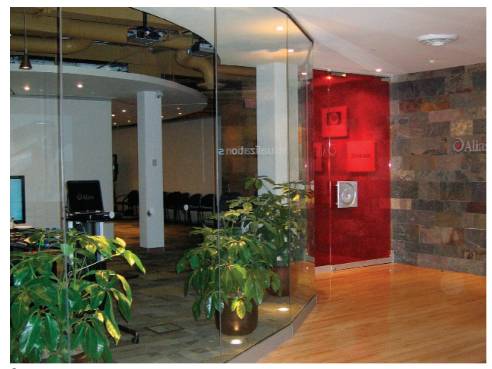
2 Visitors get a sense of arrival and departure from the VizStudio through the use of funneling toward the semitransparent red door.

type of corporate boardroom and the potential benefit that large-display systems could have in this type of environment. The intention was that large displays would allow the company and customers to visualize and discuss their meta issues or demonstrate concepts visually, within the context of group discussions.