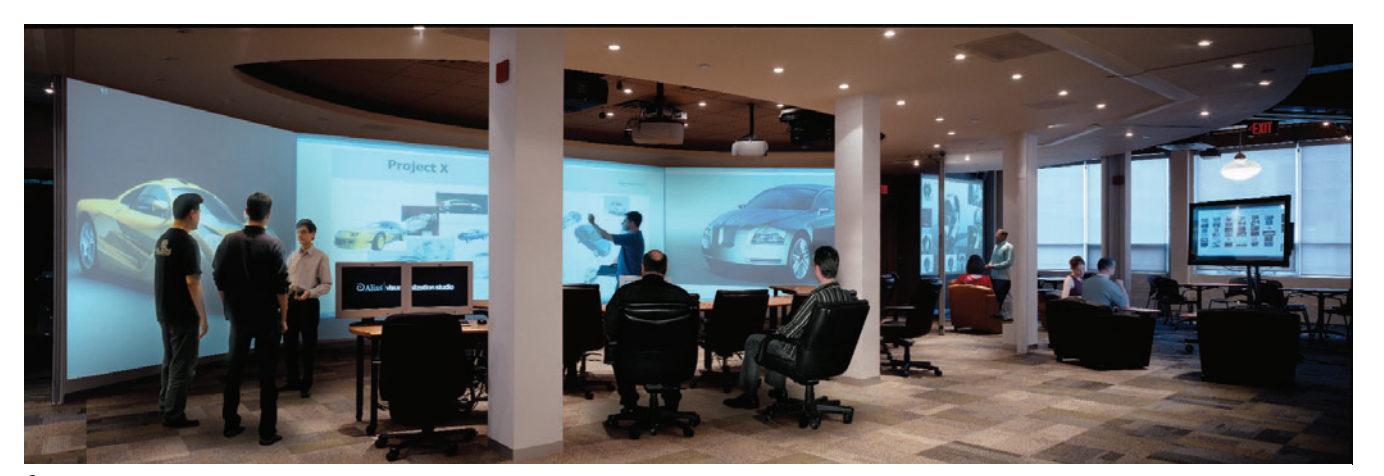
1 Alias Visualization Studio.