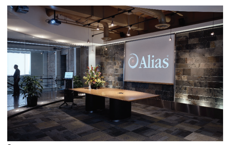
3 Reception area consisting of table, large displays, and a water wall.

Second, the room design focuses the more formal activity close to the main front display while less formal activity occurs in the back of the room. While this might seem obvious, we note that this attribute is important. Having a unified formality would make the meetings feel stiff. Allowing people to chat in the back and come and go from the space is important for many types of