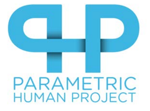
Figure 1. The logo of the Parametric Human Project represents the acronym together with the traditional icon for "Hospital" and drawn as a single ribbon to convey wholeness (design by Justin Matejka).

frustratingly few clinical advances."[1] Furthermore, previous efforts have not taken a first-principles approach; a digital human model should begin with a human model. Yet, to date, a comprehensive anatomical ontology describing a complete morphological database has not been created. While the Visible Human Project [2] and the Virtual Physiological Human [3] are impressive related efforts, neither project has yet resulted in this type model. We hypothesize that the difficulties in creating a datadriven statistical human morphological model have prevented others from making progress in this area and this leads to mathematical modelling of abstract representations of idealized gross anatomy or sub-anatomic cellular modelling. Instead, we focus on geometric and ontological modelling in support of high-level biomechanical simulation. We emphasize the "parametric" aspect of humans to not just build a model of a specific human but to develop an understanding of human variation and covariation of groups of morphological features. This common goal of the consortium is represented in our identity as a group (see Figure 1).