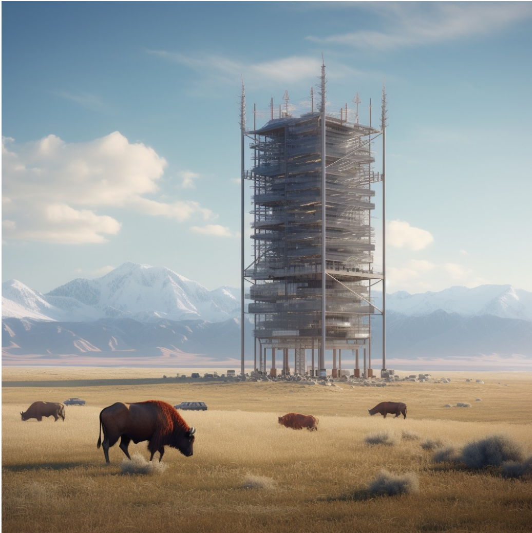
Midjourney: A realistic photo of a new skyscraper being built on stilts located in a springtime prairie in Wyoming with buffalo wandering in the distance. mountains in the background. Lens blur.

In an undeveloped valley of northwestern Wyoming, something new is stirring. Instead of the usual bison wandering the horizon, herds of technology journalists, city planners, construction workers, and hopeful settlers have gathered to celebrate the first phase of development of “IRL,” the most ambitious new city project in North America made possible by the recent digital-first government policy from Wyoming legislature.