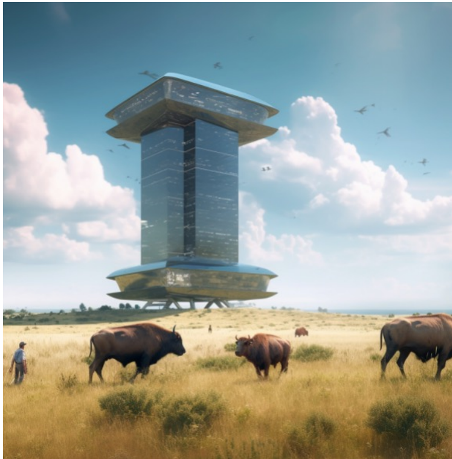
Midjourney: A high resolution photo of a new futuristic skyscraper on stilts located a prairie in Wyoming with buffalo wandering in the distance.

The city of IRL promises healthier and happier lives for its residents, but not all residents will be physically located in IRL. Virtual citizens can participate in the civic development of this Wyoming municipality by engaging with the digital version of IRL. It is within these virtual spaces that teams of citizens are generating new structures and landscapes, and passionately debating different versions for each future planned structure.