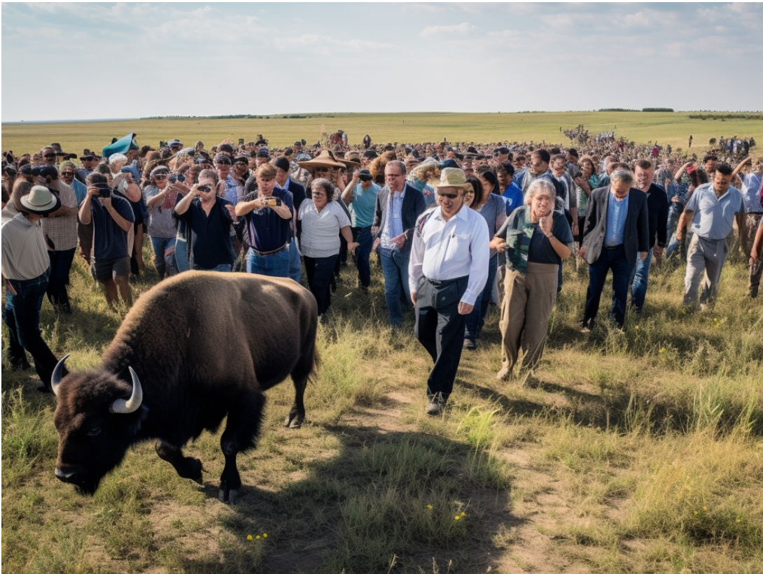
Midjourney: Photography a ribbon cutting ceremony with the mayor, crowd and press in a prairie in Wyoming, part of the crowd is walking away from a buffalo on the side. Realistic.

While tremendous digital simulation had been used to plan the day's ribbon cutting ceremony, nature's inherent unpredictability reminds us that while we have full control over the laws of our digital worlds, we are still guests of the natural world, and it has laws of its own.